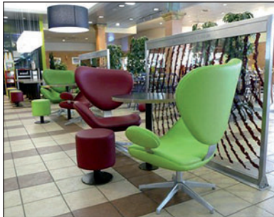
TEXTILES FOR INTERIOR CONTRACT FURNITURE